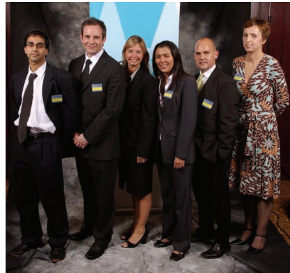
The Energy Risk conferences team